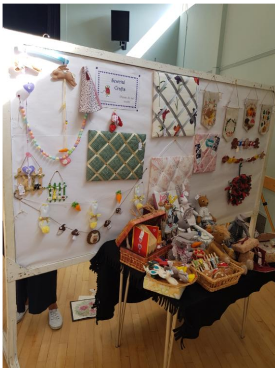
Some beautiful work from 2025.

S.T.A.R stands for S mall T asks A s and when R equired. We are very fortunate to have so many group leaders who generously give their time and life energy to make our organisation so successful and enjoyable for members. In addition all our social events, which add so much, are supported by volunteers who make them happen and are an important part of our members experience. We are always hoping to add to our group of willing helpers. So, if you could help on an informal basis and be able to respond to a request for additional help from time to time, we would be glad to hear from you. Taking a turn and helping with Coffee mornings or any of our social events that require extra support is what is needed. No regular commitments or meetings just a willingness to be called upon when necessary and to be flexible enough to work alongside our existing team. Contact: sthomaspeter@btinternet.com